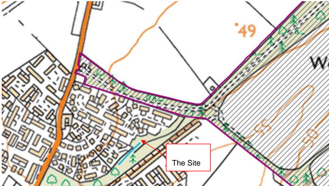
Figure 3: Environmental Scotland