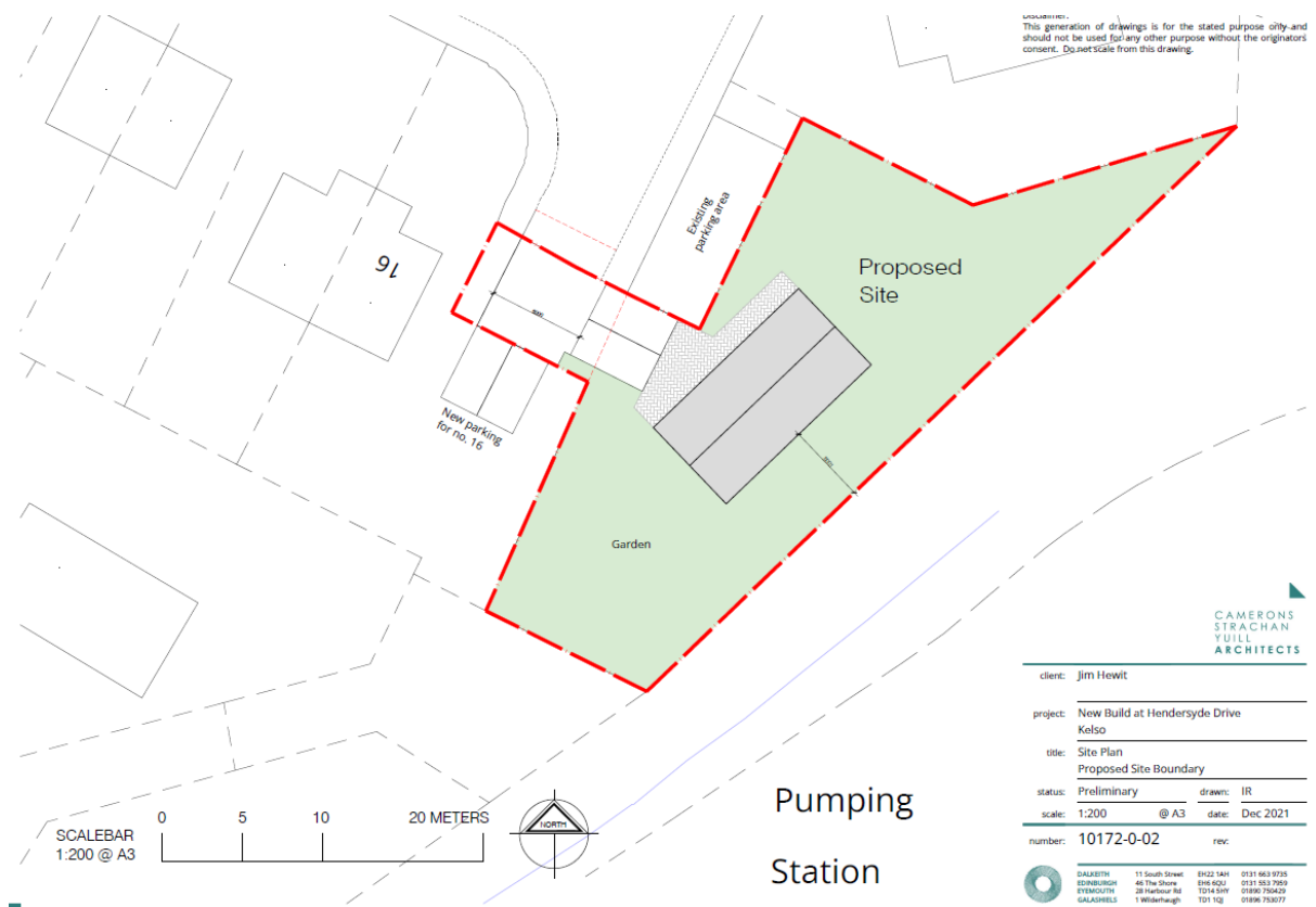
Figure 4: Proposed Site Plan

3.3 In terms of layout, the access is proposed off Hendersyde Drive, adjoining number 16 Hendersyde Drive to the west of the plot. The existing parking area is to be retained as illustrated in figure 4 above with two parking spaces proposed for the new dwelling, and the relocation of two new parking spaces for residents at 16 Hendersyde Drive.