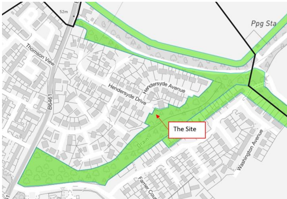
Figure 2: Adopted Proposals Map